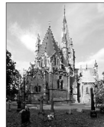
The symbol of the Trønderlag is the Nidaros Cathedral in Trondheim.

The 2014 tour celebrated the 200th Anniversary of the signing of the Norwegian Constitution. Members of the group joined with the Syttende Mai adult parade in Trondheim on May 17 and participated in a special service at Nidaros Cathedral.