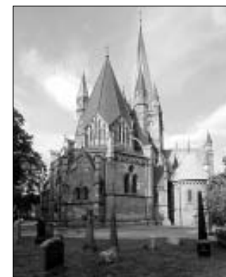
The symbol of the Trønderlag is the Nidaros Cathedral in Trondheim.